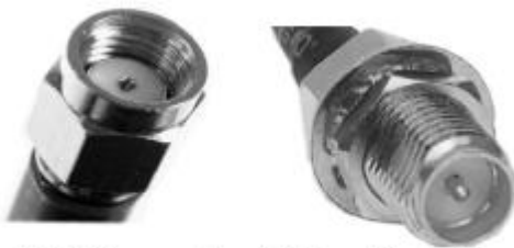
SMA Connectors (Male - Female)

Connectors are industrial standard component, below are selectable: