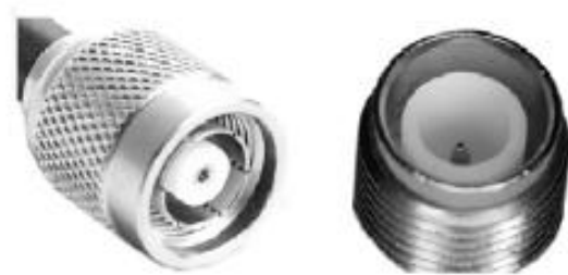
TNC Connectors (Male & Female)