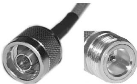
N Connectors (Male - Female)