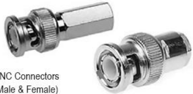
BNC Connectors (Male & Female)